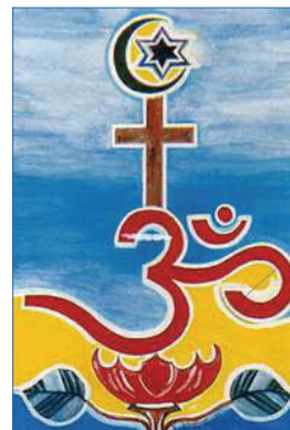
Rain Location - Sharen